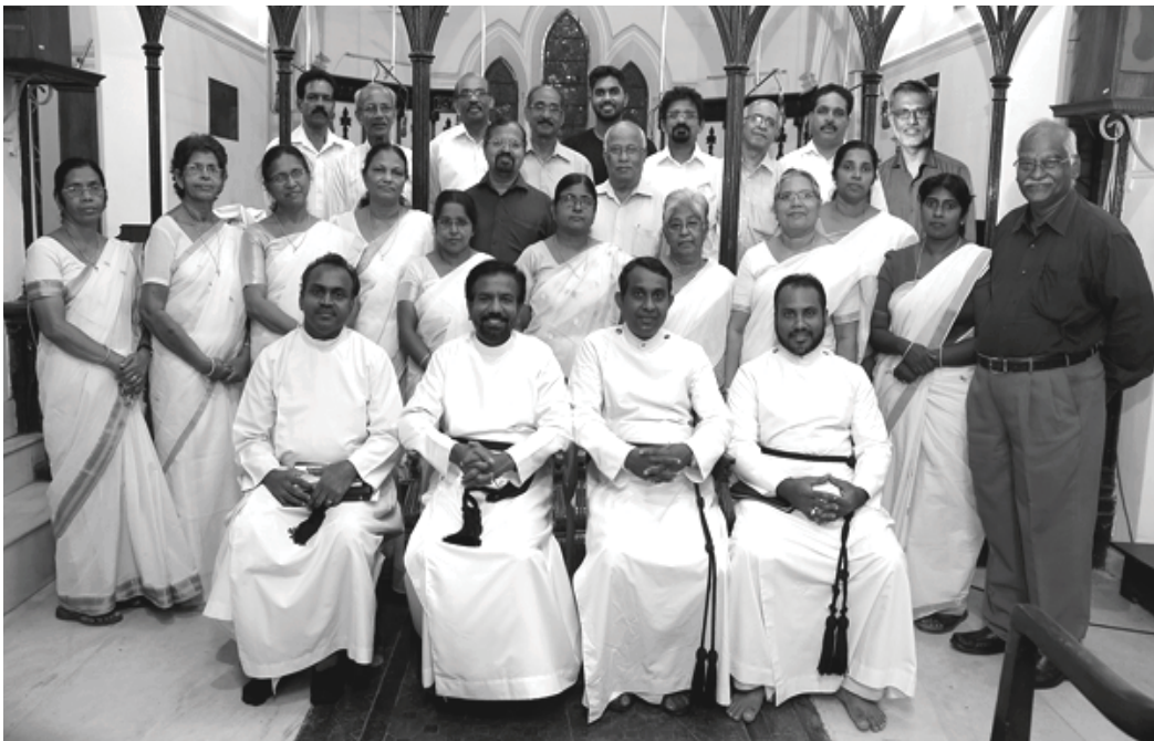
ALMAYA CONVENTION CHOIR