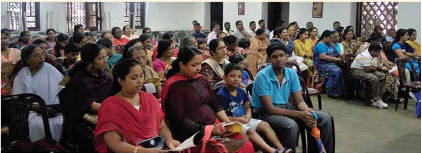
Christ Church Sunday School Parent Teacher Meeting 18 th June 2016