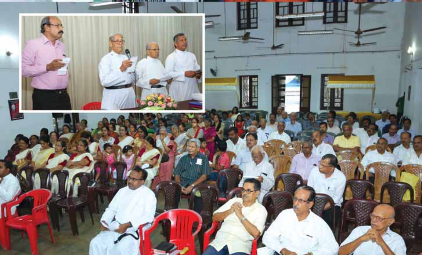
Peroorkada Area Prayer Group Anniversary