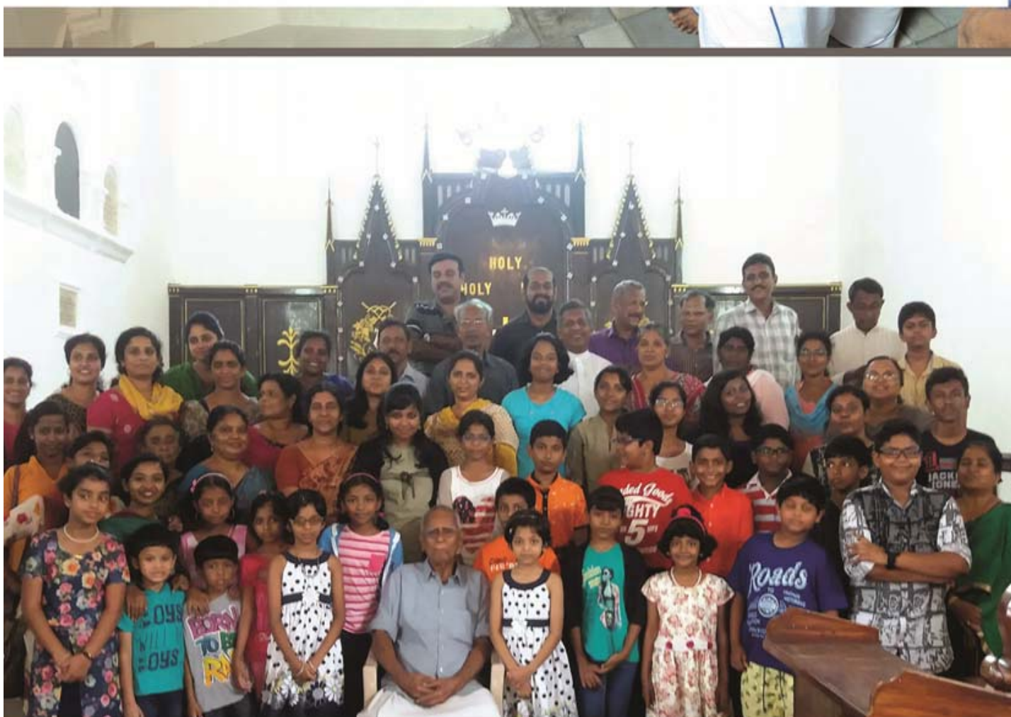
Sunday School Picnic at Alappuzha on 22nd October 2016