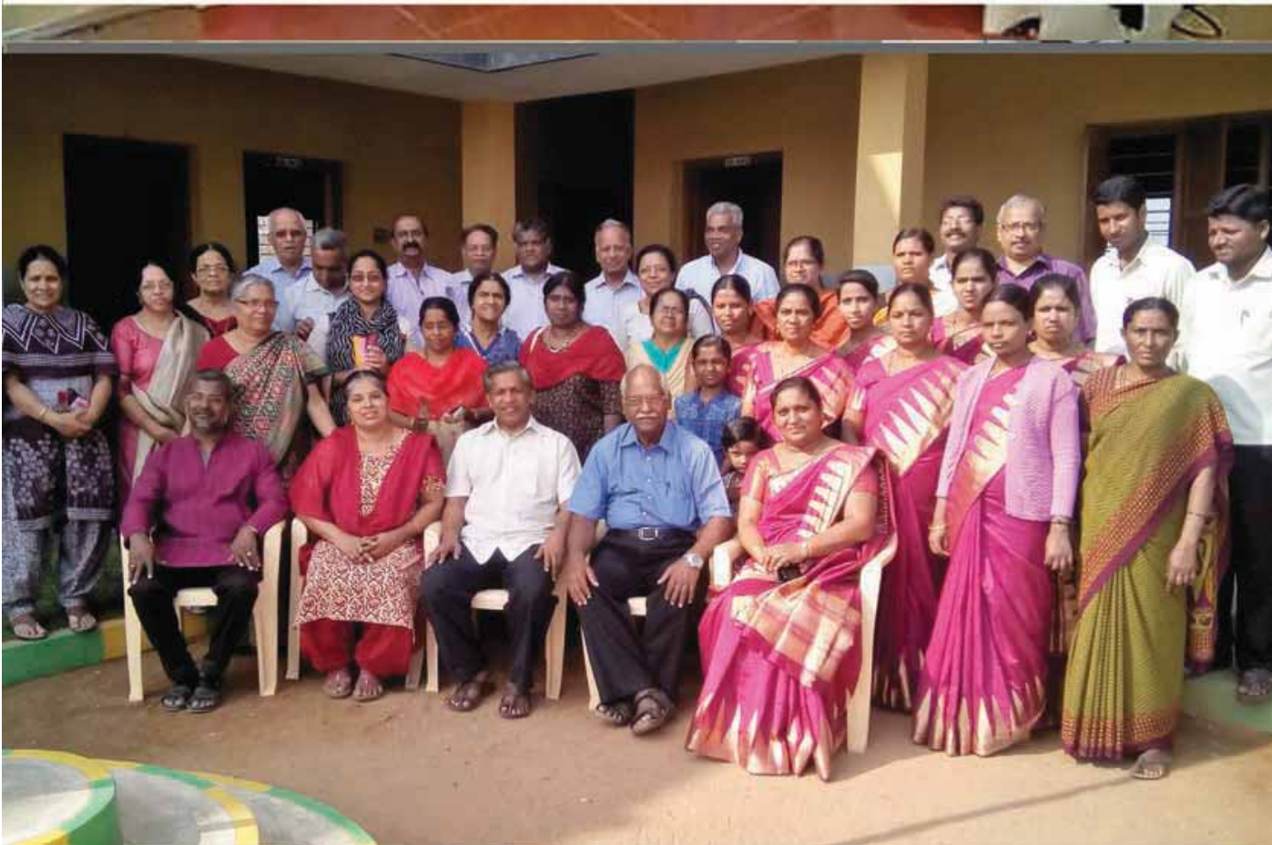
Almaya Fellowship Mysore Mission Field Visit from 20 th to 23 rd Feb 2017