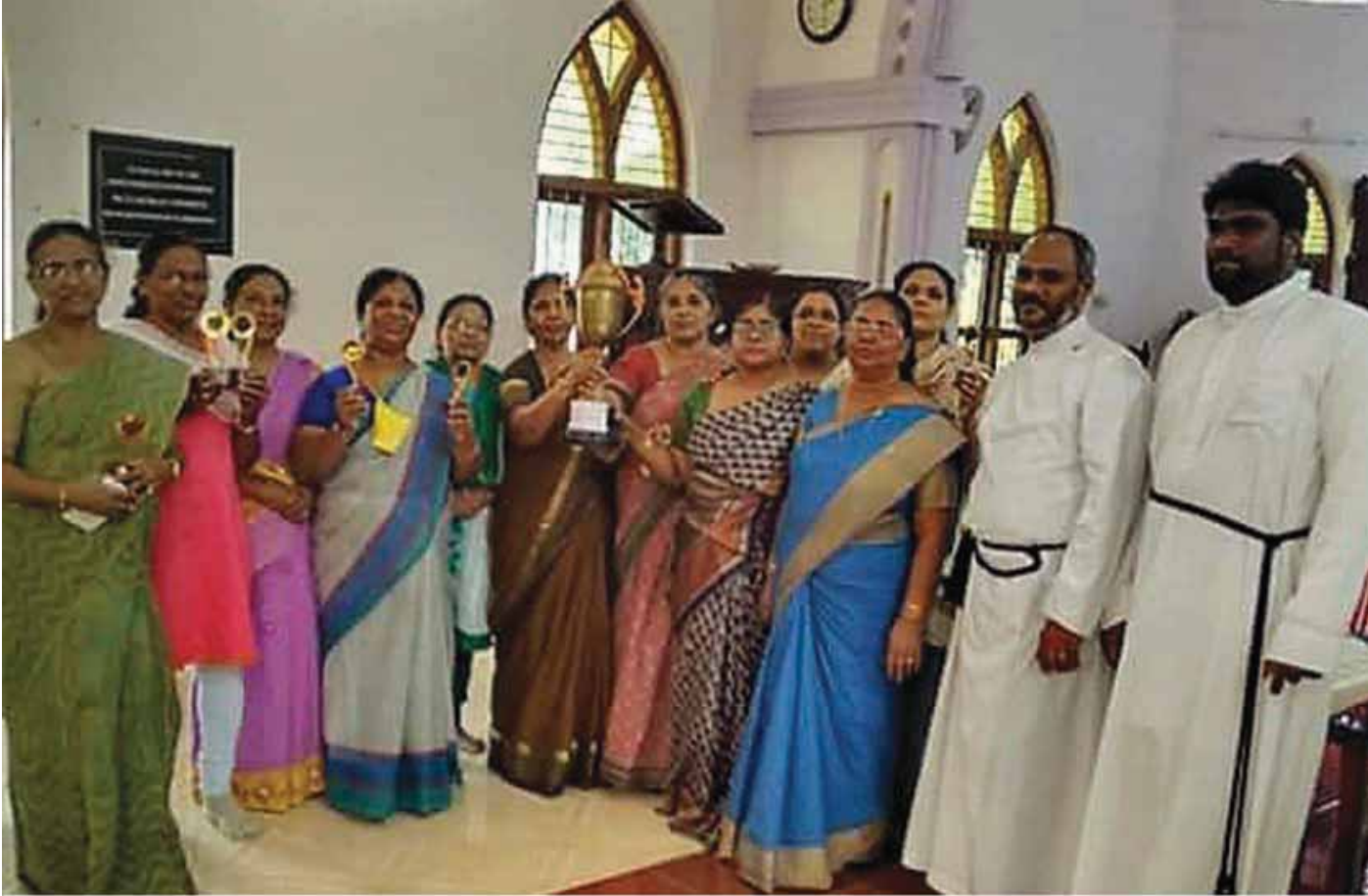
Women's Fellowship Adoor District "Kalamela" on 11 th February 2017 at St. Thomas CSI Church, Thazhathumon