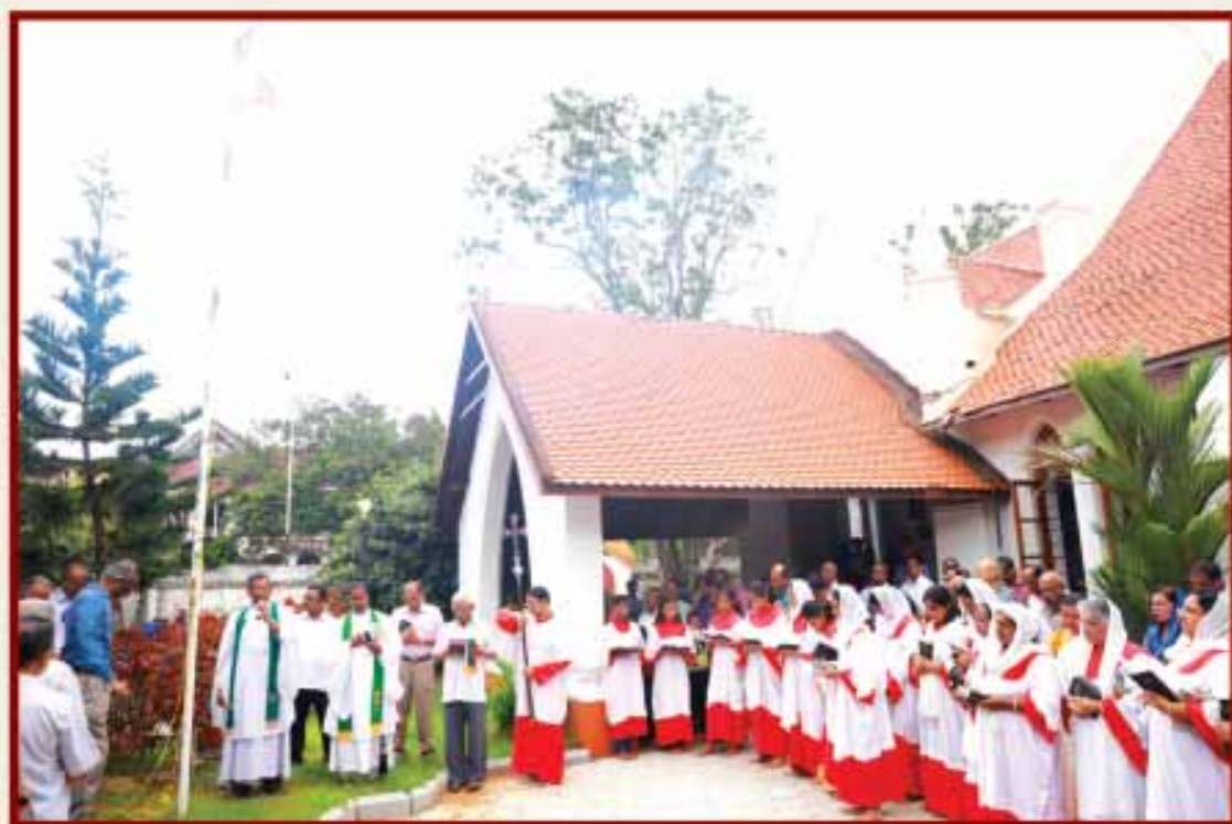
C.S.I. Flag hoisting on Sunday 24 th September 2017 (C.S.I. 70 th Formation day was on 27.09.2017)