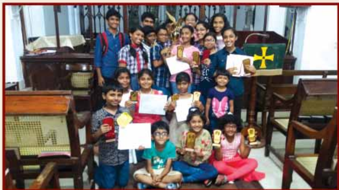
Christ Church Sunday School who scored 1st in Adoor District Kalamela on 21 st September 2017