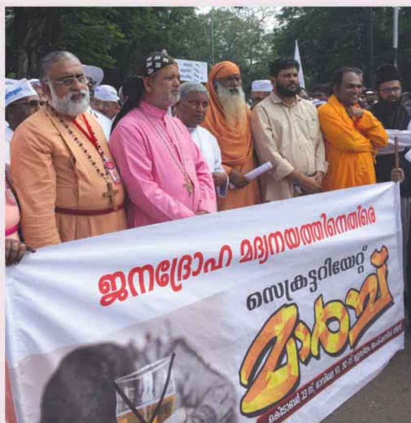
Secretariat March at the flag off point near Museum Jn. Trvandum on 23 rd October 2017