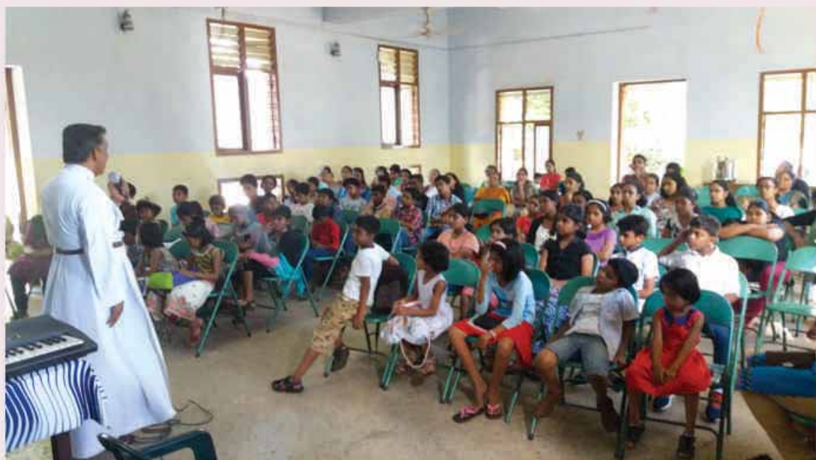
Annual Sunday School Camp at Zenana, Fern Hill 29th September 2017