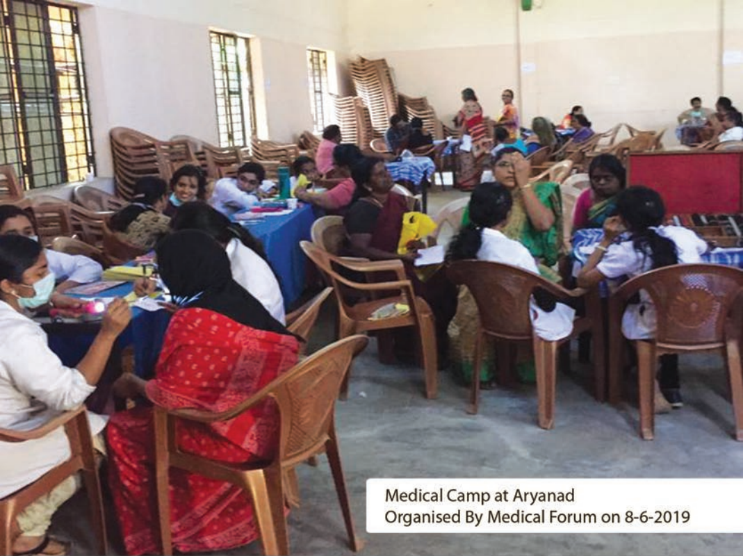
Medical Camp at Aryanad Organised By Medical Forum on 8-6-2019