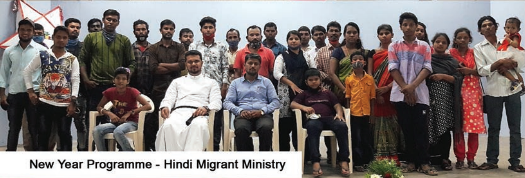
New Year Programme - Hindi Migrant Ministry