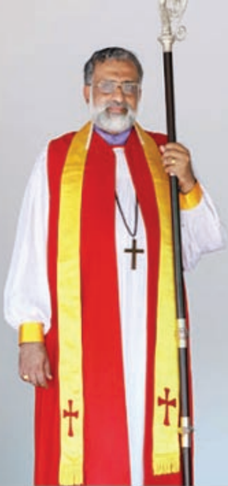
Christ Church, Trivandrum Family wishes Thirumeni and Kochamma a contented and blessed long life